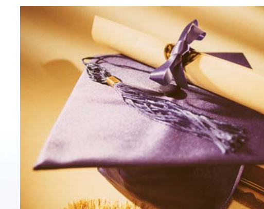
OCDSB students have distinguished themselves at colleges and universities throughout Canada and around the world.

Summer programs for international students are available for students 9 years and older.