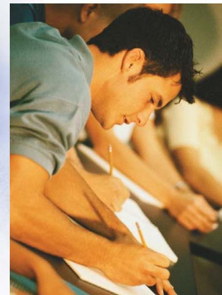
International students coming to study in the OCDSB can choose an educational path that best suits their interests and academic goals.