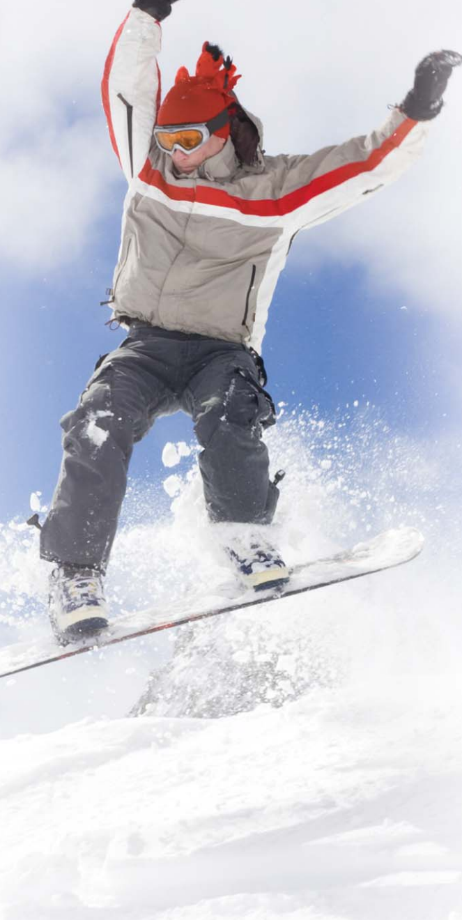
Ottawa has plenty of excitement to offer students all year long!